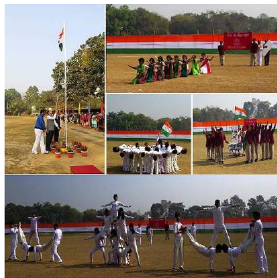
Celebration of Republic day 2017 in DAV Model School

India ushered in a new era with the framing of its Constitution which came into effect on 26 th January 1950. The students of DAV Model School commemorated India's 68 th Republic Day with great enthusiasm. They showcased a performance of nationalism, unity and integrity through the flag hoisting ceremony followed by the parade and subsequent cultural events. Melodious patriotic songs followed by a dynamic show of dance made the celebration memorable. The enlightening speech by our Principal imparted great knowledge and instilled a spirit of patriotism amongst all of us. The celebration was concluded with great solemnity.