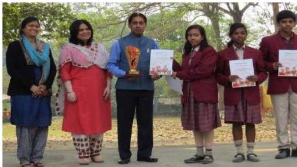
Help age India prizes and certificates

A student of class VIII received the first prize and also got a scholarship of Rs. 5,000. Other students who also had participated got participation certificates.