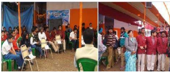
Kharagpur Boimela quiz

The students of DAV Model School came out with flying colors in the Inter School Quiz Competition held in Town Hall on 12th January, 2017 organized by the Kharagpur Boimela Committee by the securing the first position. A total of 35 schools had participated in this event. The participants from our school were from Class IX and Class XI. They made it to the first position in this prestigious event through their immense knowledge. They excelled in this competition and made our school proud through their great effort and achievement.