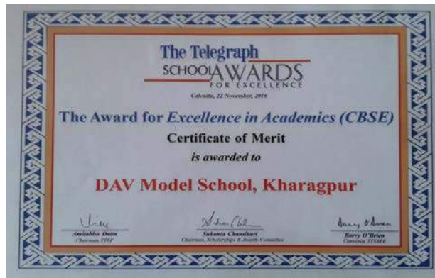
Telegraph School Awards for Excellence

DAV Model School IIT Kharagpur received the prestigious Telegraph School Awards for Excellence in Academics which has brought great honor to the school.