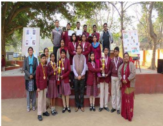
1st prize in Scitek-2017 3rd prize in Quizo-4ia-17 1st and 3rd prize in PowerPoint

Treading the path of a pioneering route, the innovative young minds of our school showcased their talents on the prestigious Hijli Scitech (District Level) platform to accomplish great aspirations. This event was held within the Hijli school premises on 19 th to 21 st of January. This three day event comprised of a science exhibition, quiz (Quizo-4ia), brief subjective oral presentation (through slideshow) and a four minute movie making contest. The novel ideas presented by students received great appreciation and admiration. This occasion was further embellished by the advent of the distinguished dignitaries. Children who came up with promising ideas for a sustainable future were rewarded for their innovation. Their participation in this curriculum has further enhanced their knowledge, aptitude and experience.