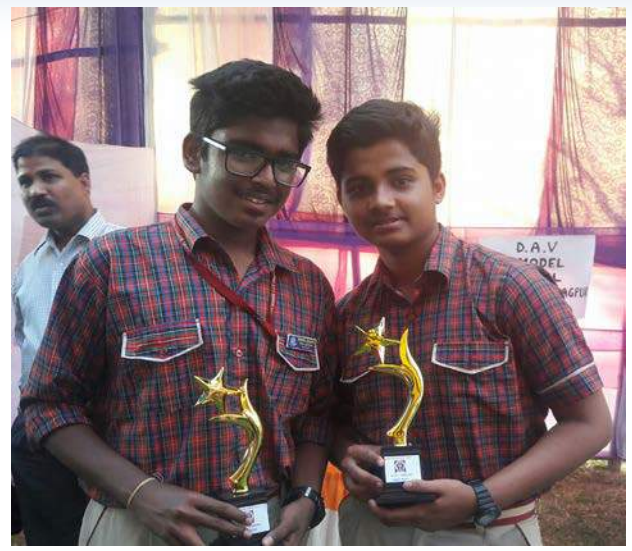
Agri Expo 2017

Our school students participated in different competitions and won prizes too. Students secured 2 nd position in Elocution, 1 st position in Model Making & 1 st position in Quiz.