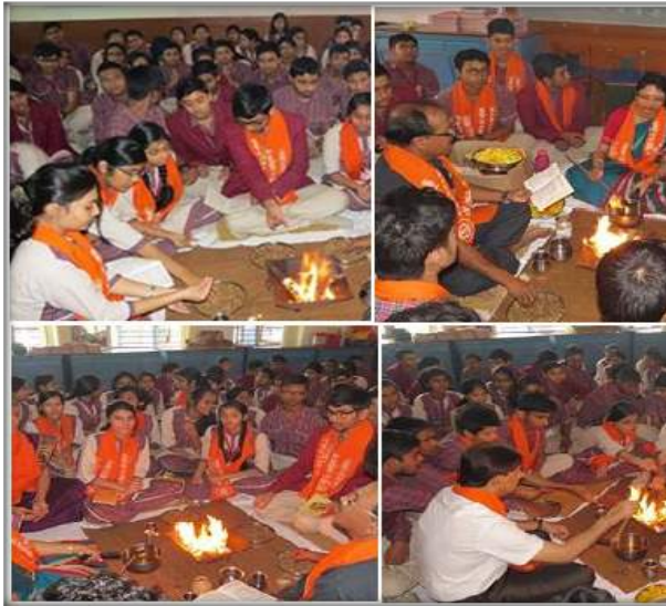
Blessings for Class X

W ith the Class X Board exams round the corner all the students were on their tenterhooks! To imbue them with confidence the school organized a yajna on 23 rd of February within the school premises. All the teachers and along with the Principal bestowed their blessings and best wishes for an excellent exam and bright future.