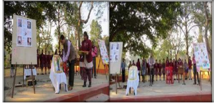
Celebration of the birth anniversary of Netaji

enthusiastic schoolmates delivered speeches and songs which were totally mesmerizing. The whole programme was approached by eager students.