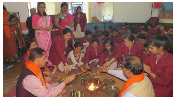
Blessing For a good future

These keywords must have helped all the students, of D.A.V Model School, IIT Kharagpur, to live an exceedingly successful life.